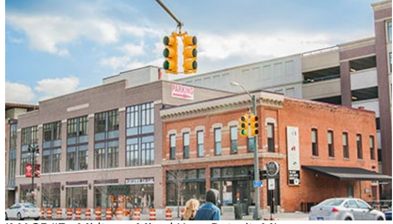
MAGE #7 - Midtown Mixed Use - Detroit. N Adaptive Re-use mixed with Infill buildings.