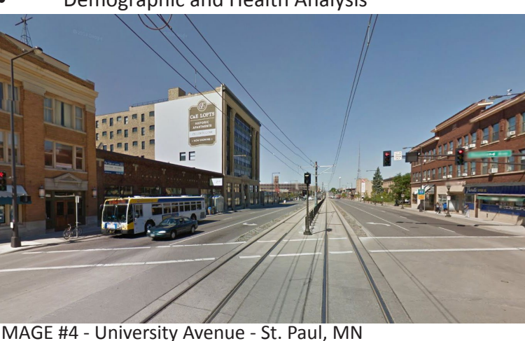
Mixed-Use: Industrial, Commercial & Retail