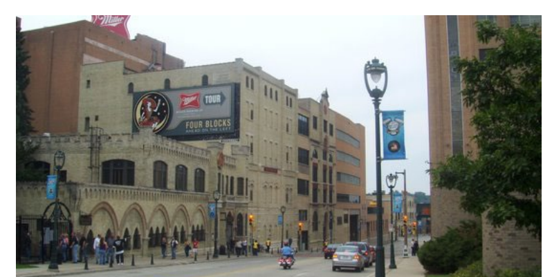
1AGE #11 - Miller Brewing Co. - Milwaukee, W Industrial use within a walkable environment

Strategies for entrepreneurship and inclusive innovation Marketing sites to local and national interest Demographic and Health Analysis