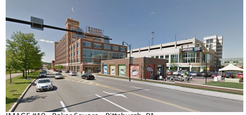
AGE #10 - Baker Square - Pittsburgh, PA Re-use of industrial building around transit

Strategies for entrepreneurship and inclusive innovation Marketing sites to local and national interest Demographic and Health Analysis