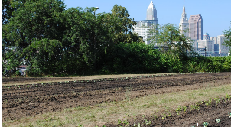
AGE #9 - Urban Farming - Cleveland, Large scale urban farming next to food retailers in Ohio City.

Strategies for entrepreneurship and inclusive innovation