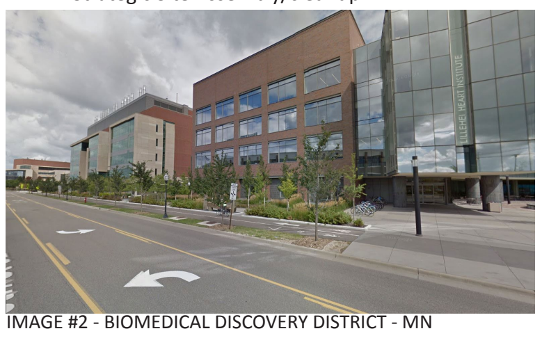
Research facilities surrounded by a cycle track.

Strategies for entrepreneurship and inclusive innovation Marketing sites to local and national interest Demographic and Health Analysis