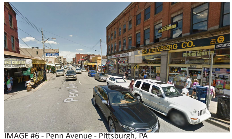
Urban Industrial District.