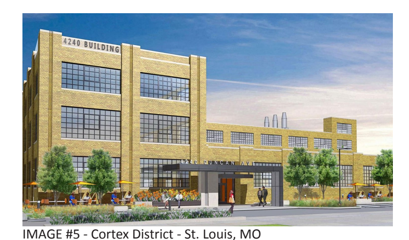
Adaptive re-use of industrial building into a ship/tech company.

• Strategies for entrepreneurship and inclusive innovation