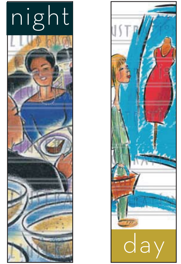
ELEVATION - NIGHTTIME GRAPHIC scale: 1" = 1'