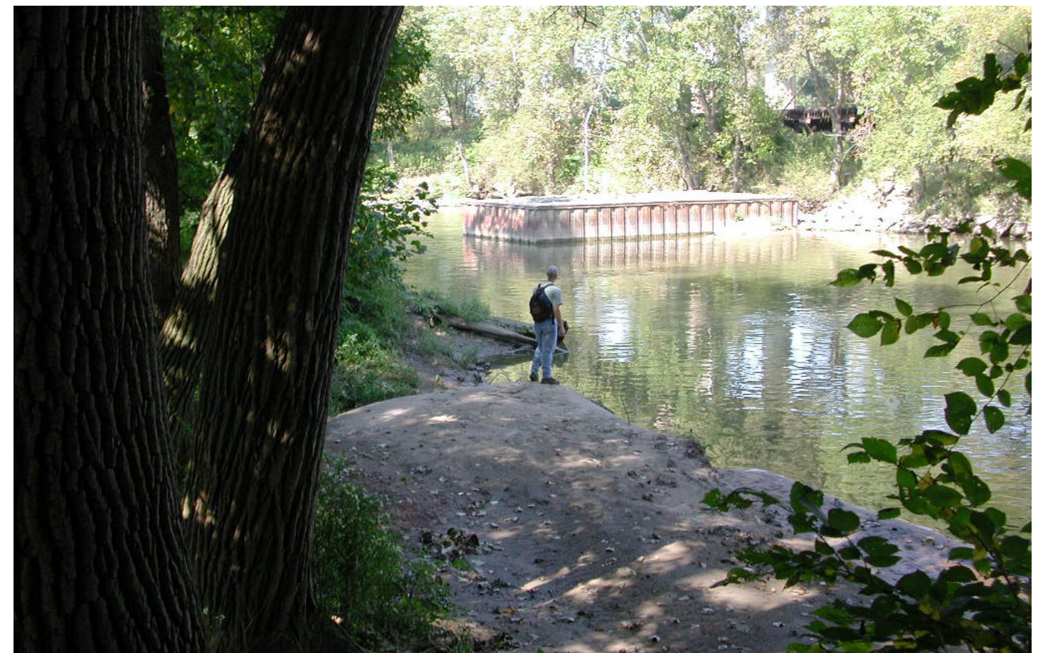
Cuyahoga River near Harvard Avenue

To the future, the Towpath Trail marks the threshold of re-invention: rebuilding a competitive economic center in a distinctive setting based upon the principles of sustainable development; illuminating the industrial grandeur and its significance; enhancing a vital, working, Cuyahoga River; offering a regional recreational amenity; and improving the quality of life by delivering people to the water's edge, where they have not been in generations.