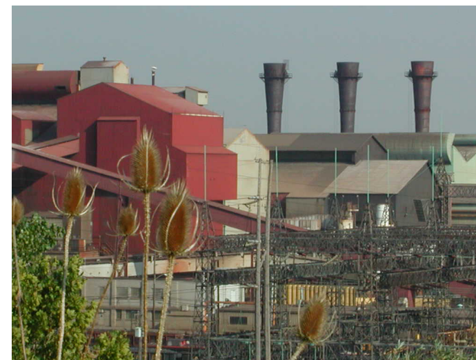
Former LTV West Side Works