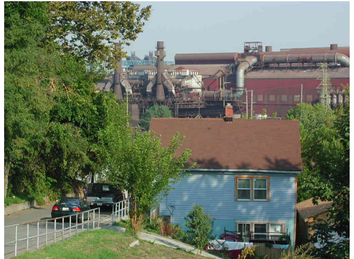
Holden Avenue looking east

A nonprofit organization partner(s) will be utilized to facilitate tax considerations for property owners. It is anticipated that title to property needed for the trail will be held by Cuyahoga County.