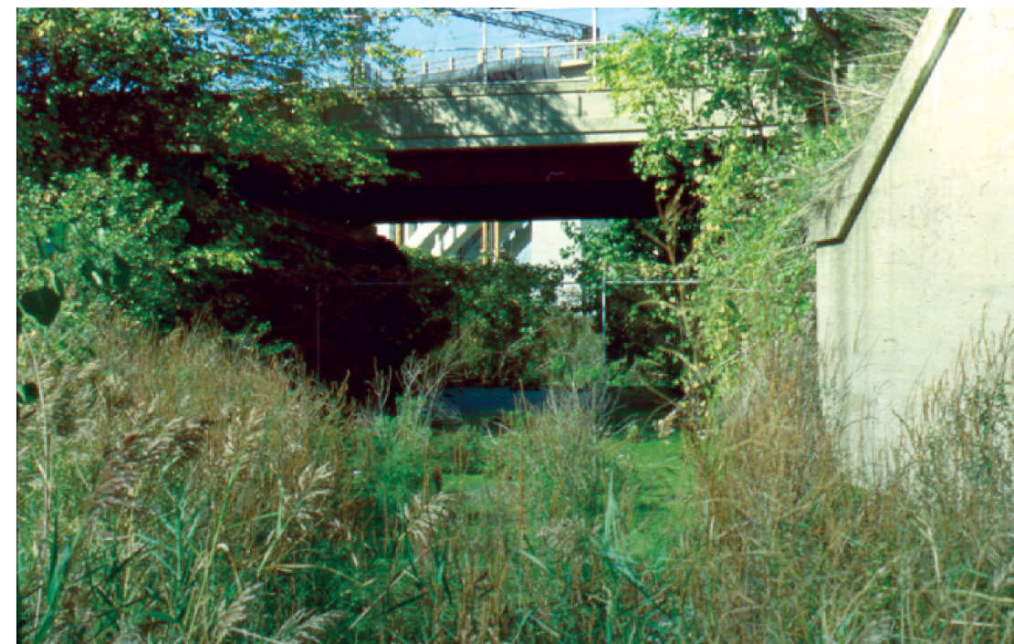
Original bed of Ohio & Erie Canal under Columbus Road at Sherwin-Williams