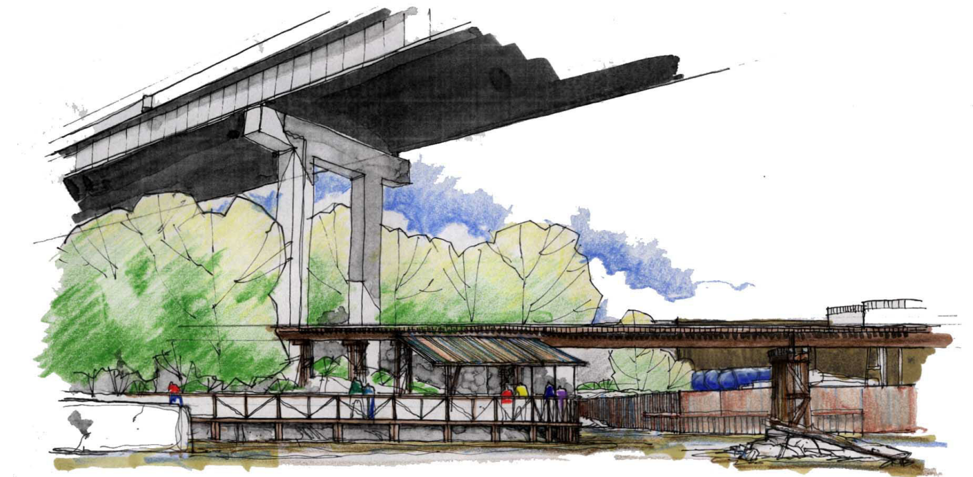
Harvard-Denison Bridge Underpass