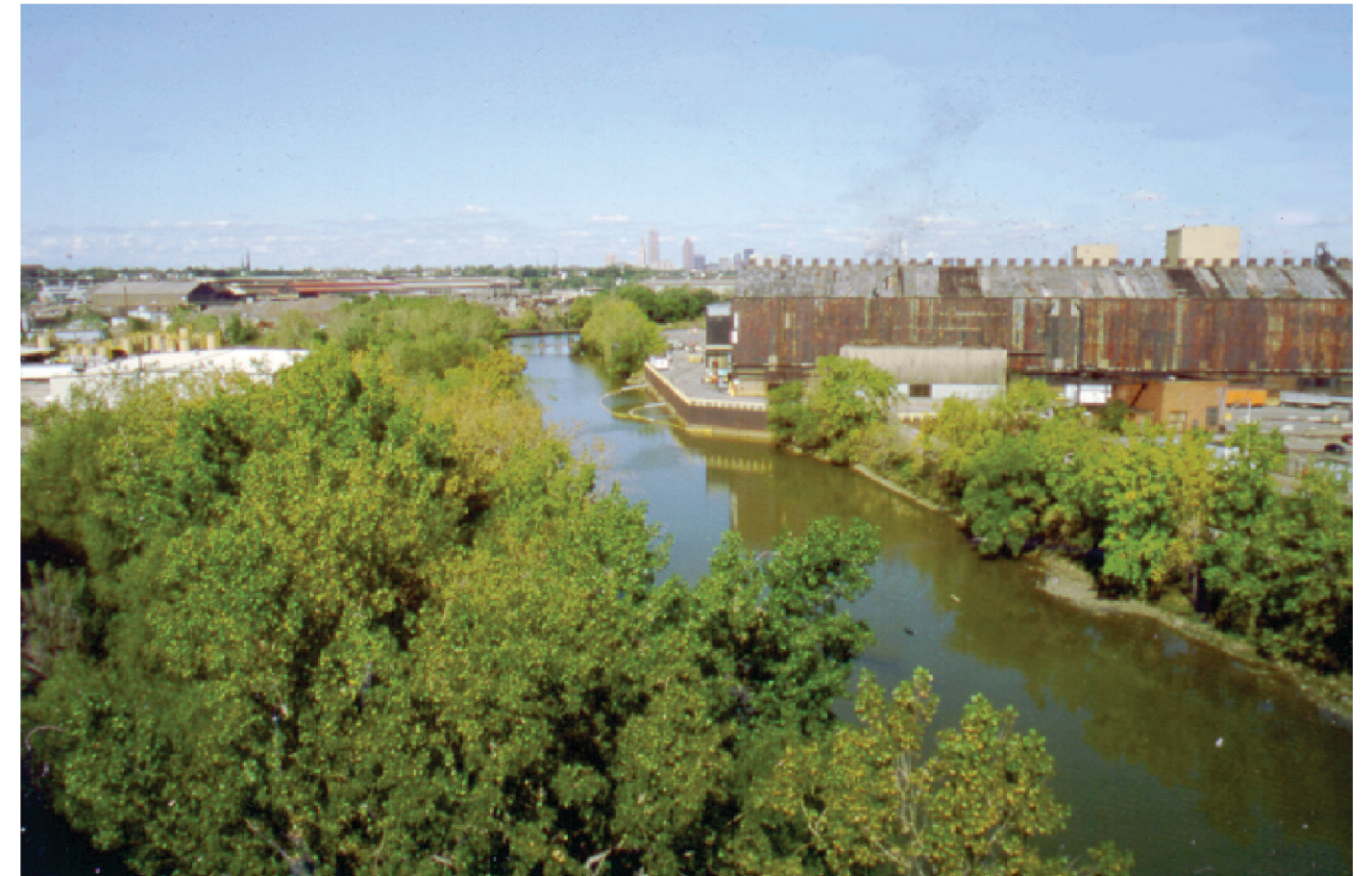
Cuyahoga River looking north from Harvard-Denison Bridge

The project plans may be viewed on the website of the Cuyahoga County Planning Commission at http://www.planning.co.cuyahoga.oh.us .