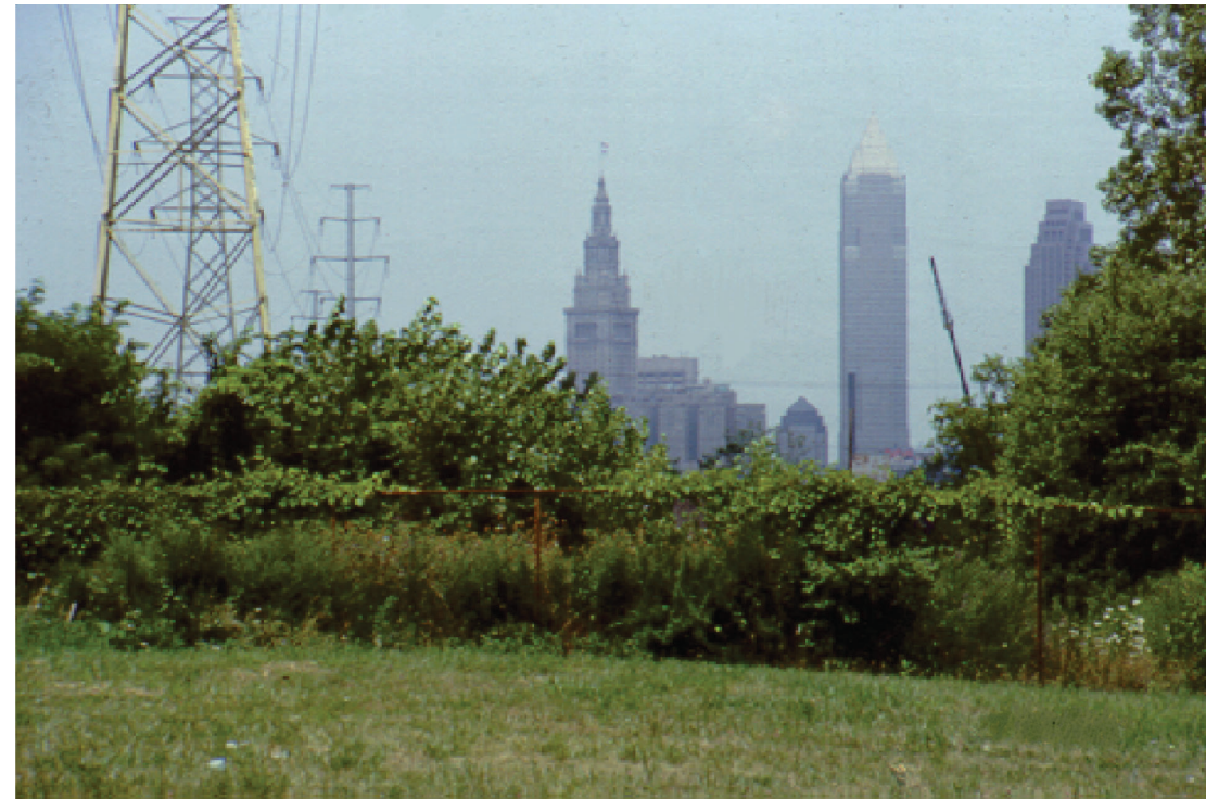
Abandoned West 4th Street Right of Way

In conjunction with site-specific improvement projects, environmental regeneration strategies need to be incorporated into the maintenance and management programs of the land users of the river valley. The strategies would also offer opportunities for extensive educational programs and partnering efforts with volunteer and community organizations.