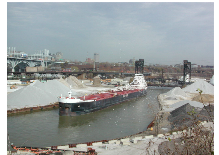
Cuyahoga River near West 3rd Street