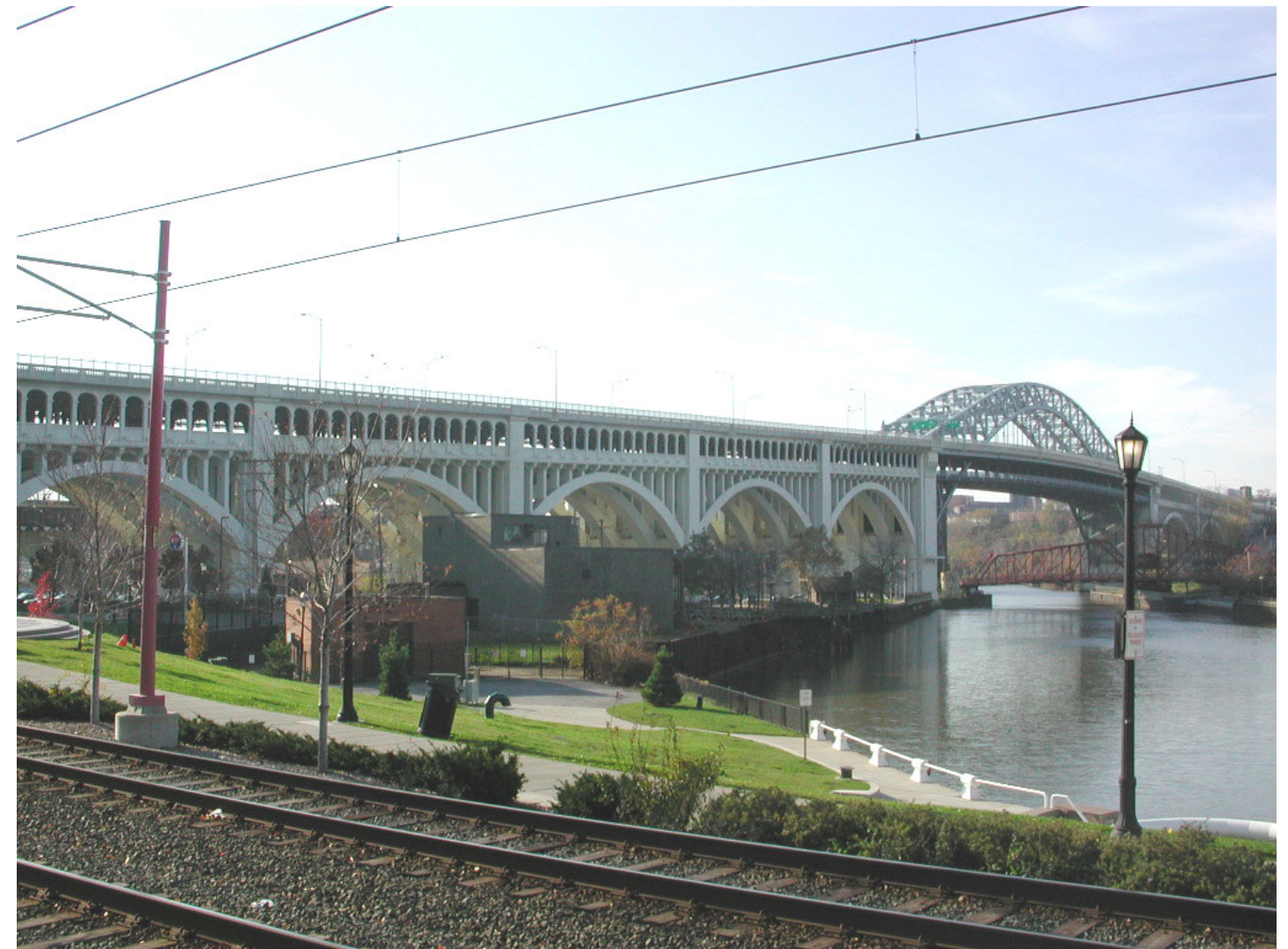
Looking south across Settler's Landing toward proposed Canal Basin Park area

The most ambitious and significant public art proposal is the design of a new, movable pedestrian river crossing for the trail. Through an international competition, a signature piece of design could be created that carries the Cuyahoga River Valley's famous bridge design legacy into a third century. The bridge is proposed to link the east and west bank of the river from approximately the Nautica Stage (west bank) to the original outlet of the Ohio & Erie Canal into the Cuyahoga River at the proposed Canal Basin Park (east bank). In addition to serving Towpath Trail users, the bridge would be a safer method for pedestrians in the Flats to cross the river instead of using the Center Street Bridge, and it would be located adjacent to the Regional Transit Authority's Settler's Landing stop on the Waterfront Line.