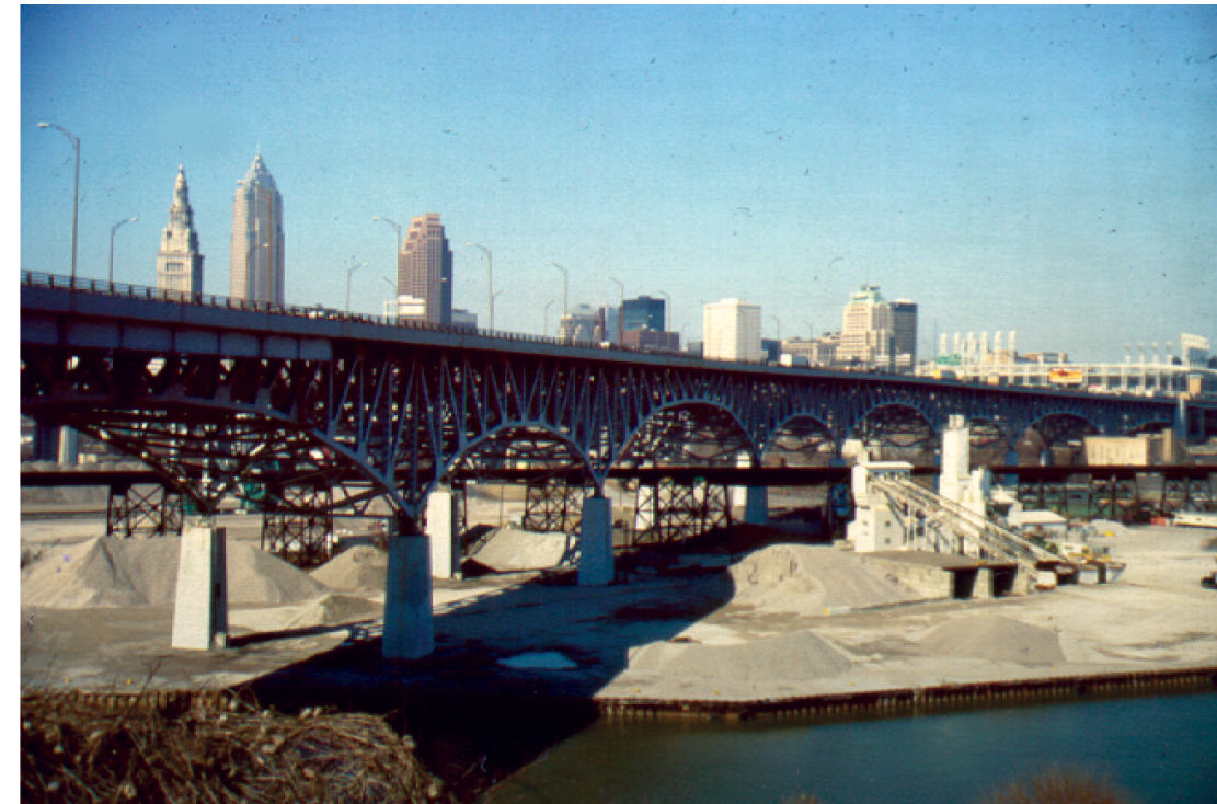
Cuyahoga River near Innerbelt Bridge

Although environmental regulations exist at the state and federal levels through agencies such as the Army Corps of Engineers and the Environmental Protection Agency, local initiatives, particularly within the City of Cleveland, will have a major influence on the future of the natural and built environments in the project area and adjacent neighborhoods. Existing or future ordinances, programs, and guidelines need to address issues such as protection of environmentally sensitive areas, retention of neighborhood character, and encouragement of economic development in a manner compatible with both the neighborhoods and the natural environment.