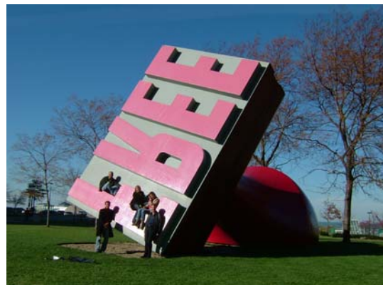
Art is often open to individual interpretation and can be a source to inspire public discourse. [Free Stamp on Willard Park]

The City of Cleveland recently showed its support for public art by enacting legislation requiring that 1.5% of the budget for every City project of over $350,000 go to public art. Streetscape projects are included in this requirement. As part of the Public Art Program , an advisory committee of design professionals and community representatives has been established to assist in soliciting designs and obtaining community input.