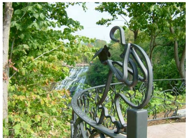
Art can reinforce the story and meaning of a place. [Mill Creek Waterfall]

Creating Distinctive Places: Arts and culture are keys to making the Cleveland area an interesting and attractive place to live, work, and recreate. They are a key component for attracting creative and entrepreneurial individuals from across the region and the nation. Arts and culture provide important insights that affect the details of design and result in great architecture, landscapes and public improvements. In addition to shaping the physical form of a place, arts and culture play an important role in creating a social connection between people and the place through interpretation of its natural features, history, and meanings and the telling of its stories.