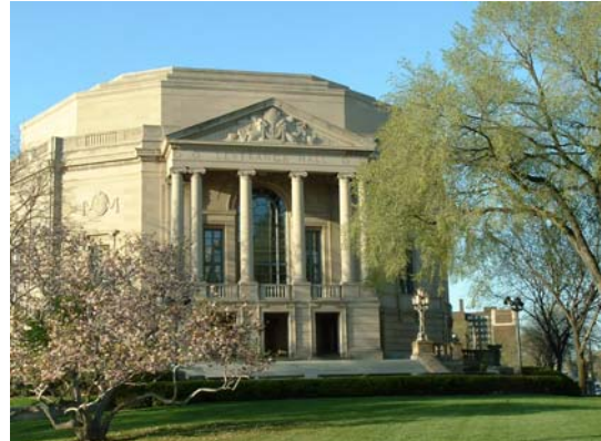
Severance Hall is home of the world renowned Cleveland Orchestra and an example of how private philanthropy has had a profound impact on the cultural heritage of the City. [Severance Hall]

Performing Arts Organizations & Venues: Local arts and cultural institutions have brought the city of Cleveland national and worldwide recognition. The Cleveland Orchestra is considered one of the best in the world. Its home, Severance Hall, is an icon in the University Circle area and one of the most highly regarded concert halls in America. Listed below are a number of other performing organizations, museums, theatres and other venues that contribute to Cleveland’s rich cultural landscape.