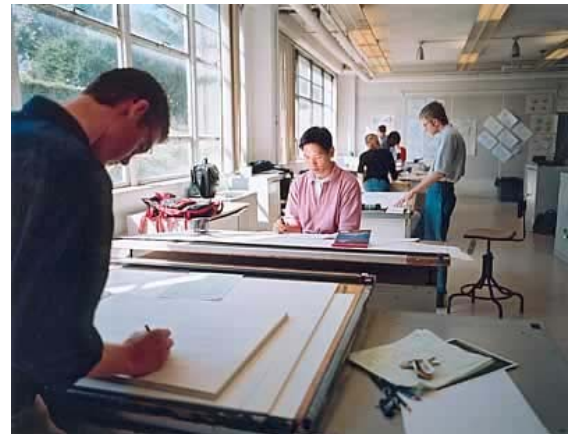
Integrating art into the design of products makes them more attractive to consumers. [Cleveland Institute of Art]