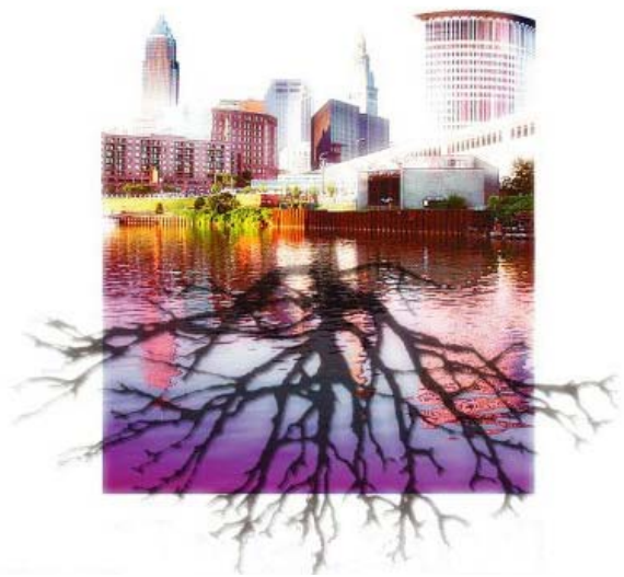
Connecting Cleveland 2020 Citywide Plan