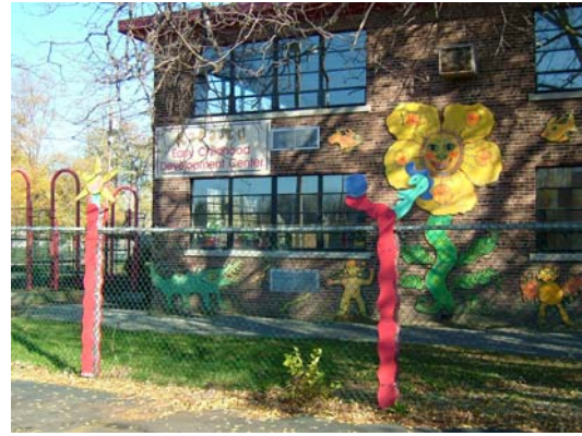
Early exposure to the arts supports the development of creative and innovative thinking.

Arts and cultural education programs must be designed that expand and broaden the audience for the arts; this effort must be inclusive in character, finding creative ways to engage people of all ages, genders, ethnic background and economic status. Providing neighborhood residents with opportunities to experience the arts in a more familiar context could help demystify the cultural experience. The involvement of area companies must also be sought. Popular support—and the convinced backing of Cleveland's business—are key to obtaining the funding necessary to restore and expand educational offerings in our schools and neighborhoods.