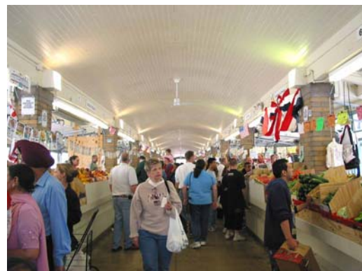
At the West Side Market the variety of the City's ethnic heritage is reflected in the foods that can be purchased. [West Side Market]

Ethnic Diversity: Even a casual perusal of the Cleveland White Pages (and Business White Pages) attests to the rich diversity of cultures still represented here; a drive through the city's 36 neighborhoods, taking note of the names of businesses, churches, social clubs and specialty shops, puts a face on our ethnic diversity. As of the 2000 federal census, 9.2% of the city's residents were of German background (not the same as "foreign-born" immigrants, though some may be); 8.2%, Irish; 4.8%, Polish; 4.6%, Italian—but according to the City's Community Relations Board, more than 117 different cultures are represented in the city of Cleveland.